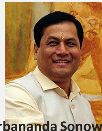
Sarbananda Sonowal Minister of Ports, Shipping and Waterways and Minister of AYUSH