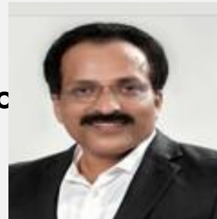
Shri S. Somanath